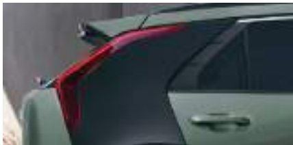
Cityscape Green + Aurora Black C-Pillar (Hybrid: SX)