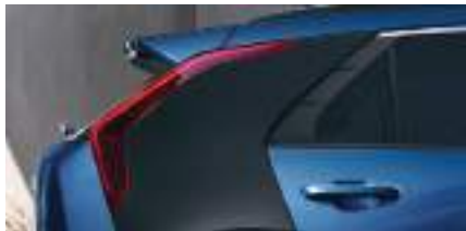
Mineral Blue + Aurora Black C-Pillar (Hybrid: SX | Plug-In Hybrid: SX Touring)