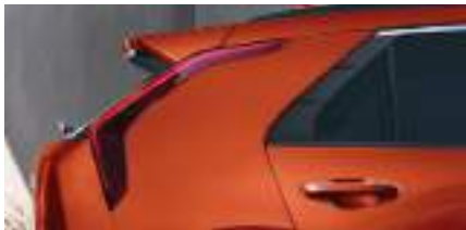
Fire Orange Metallic (Hybrid: LX, EX, SX | Plug-In Hybrid: EX, SX Touring | Electric: Wind, Wave)