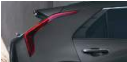
Graphite Gray (Hybrid: LX, EX, SX | Plug-In Hybrid: EX, SX Touring | Electric: Wind, Wave)