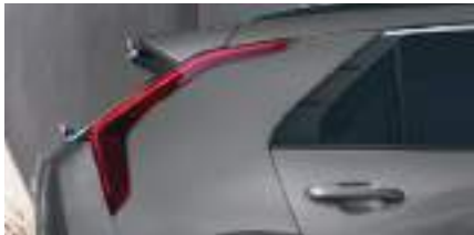
Steel Gray (Hybrid: LX, EX, SX | Plug-In Hybrid: EX, SX Touring | Electric: Wind, Wave)