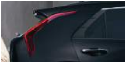
Aurora Black (Hybrid: LX, EX, SX | Plug-In Hybrid: EX, SX Touring | Electric: Wind, Wave)