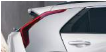
Snow White Pearl + Steel Gray C-Pillar (Electric: Wave)