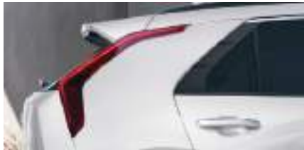
Snow White Pearl (Hybrid: LX, EX, SX | Plug-In Hybrid: EX, SX Touring | Electric: Wind, Wave)