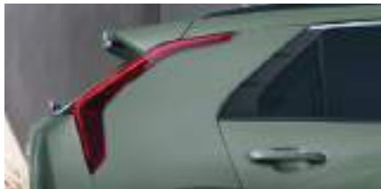
Cityscape Green (Hybrid: EX, SX | Plug-In Hybrid: EX, SX Touring | Electric: Wind, Wave)