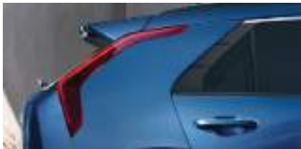
Mineral Blue (Hybrid: EX, SX | Plug-In Hybrid: EX, SX Touring | Electric: Wind, Wave)