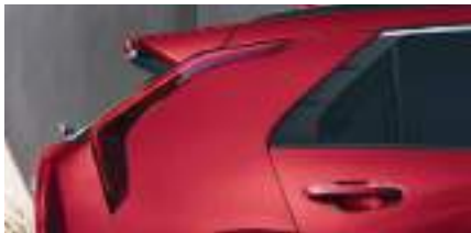
Runway Red (Hybrid: LX, EX, SX | Plug-In Hybrid: EX, SX Touring | Electric: Wind, Wave)