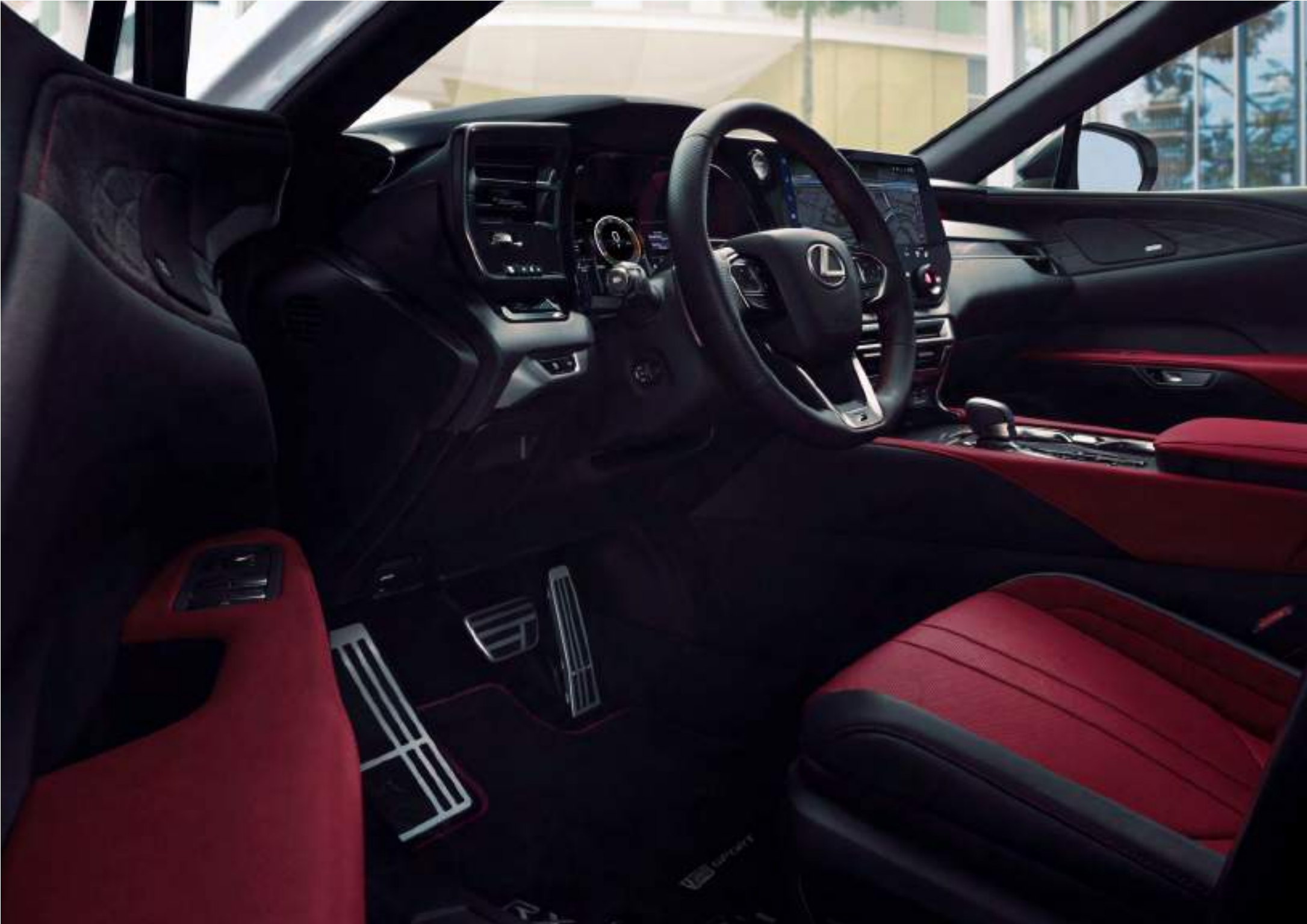
RX F SPORT Performance shown with Rioja Red leather and Dark Graphite Aluminum interior trim

Leave distractions behind. When crafting the interior of the RX, Lexus designers focused on creating a space that is open and inviting, with ready access to the things a driver needs most. Front seats offer an ideal blend of comfort and support, and for the driver, an ergonomically shaped steering wheel and intuitive controls fall easily to hand. And an elegantly concealed console storage area and available wireless phone-charging tray 7 help provide easy access to all those important day-to-day items.