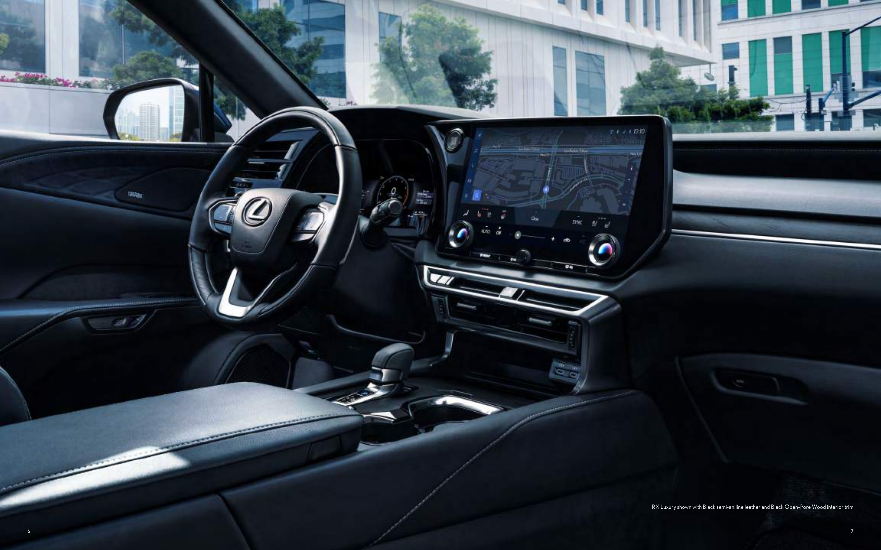
RX Luxury shown with Black semi-aniline leather and Black Open-Pore Wood interior trim