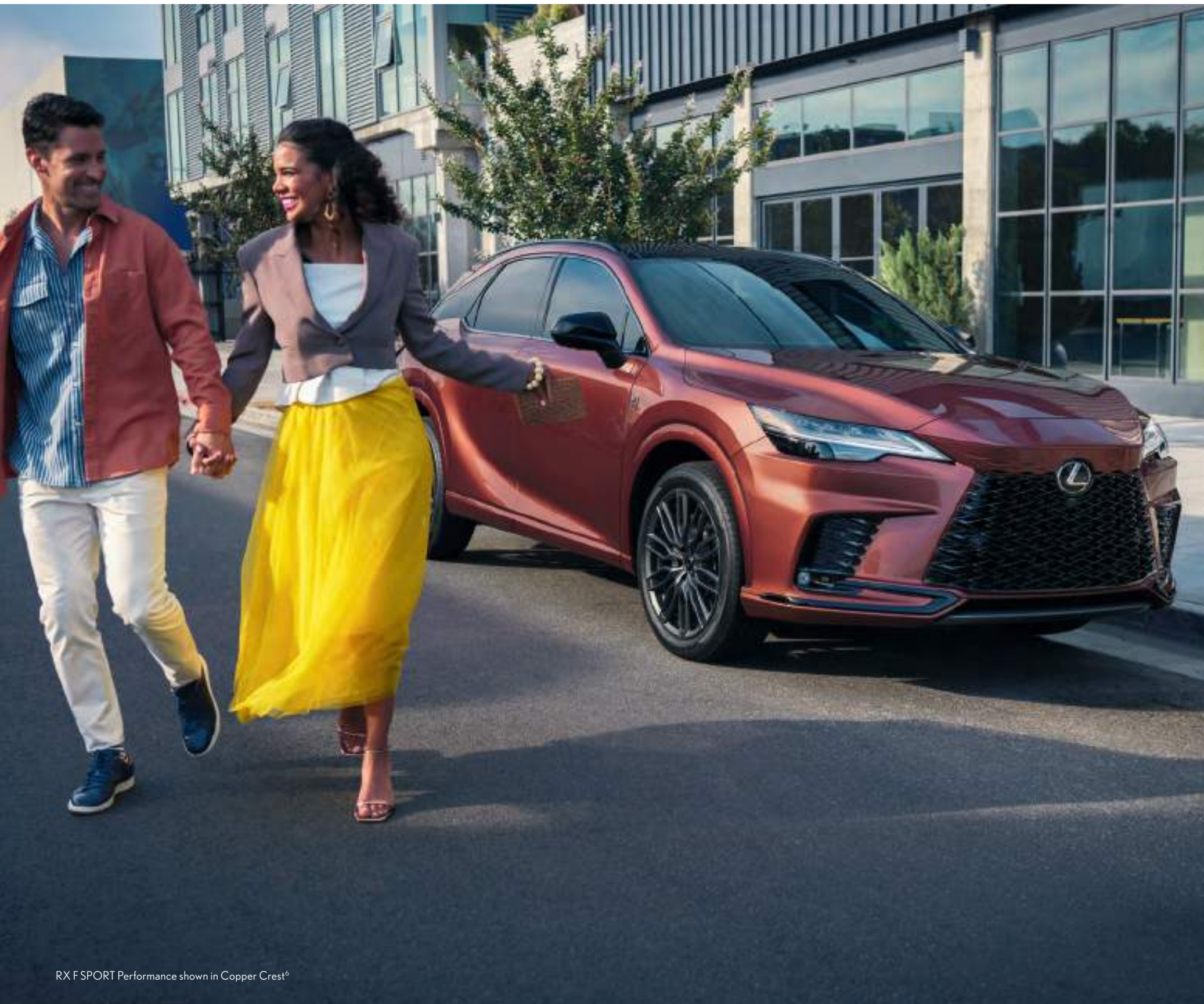
RX F SPORT Performance shown in Copper Crest ®