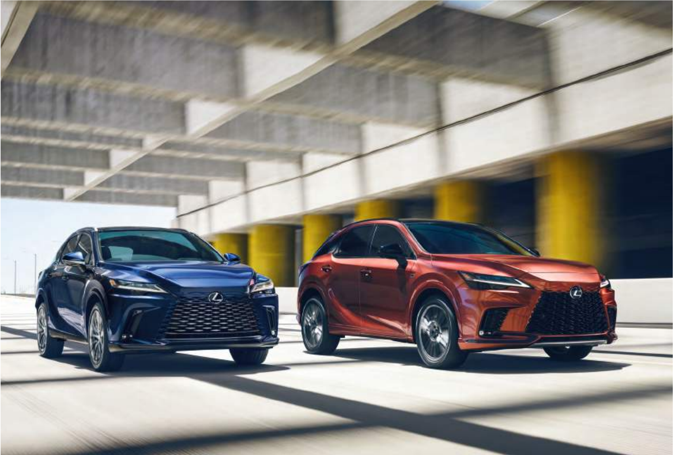
RX Hybrid Luxury shown in Nightfall Mica (left), RX F SPORT Performance shown in Copper Crest 6 (right)

For the greatest thrill offered in an RX, the F SPORT Performance boasts an exclusive electrified powertrain. Featuring a 2.4-liter turbocharged gasoline engine, a high-output battery and two electric motors, it produces 366 net combined horsepower 3 and 406 lb-ft of torque. It delivers a drive unlike anything you've experienced and helps make the RX F SPORT Performance our fastest, most powerful RX.