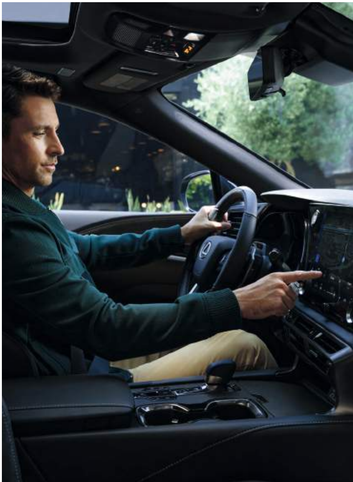
RX Luxury shown with Black semi-aniline leather and Black Open-Pore Wood interior trim