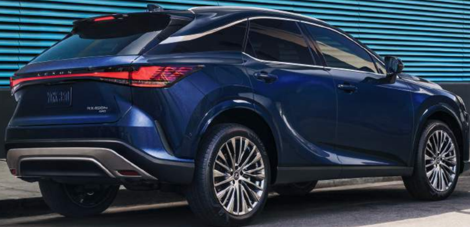
RX 450h+ Luxury AWD shown in Nightfall Mica