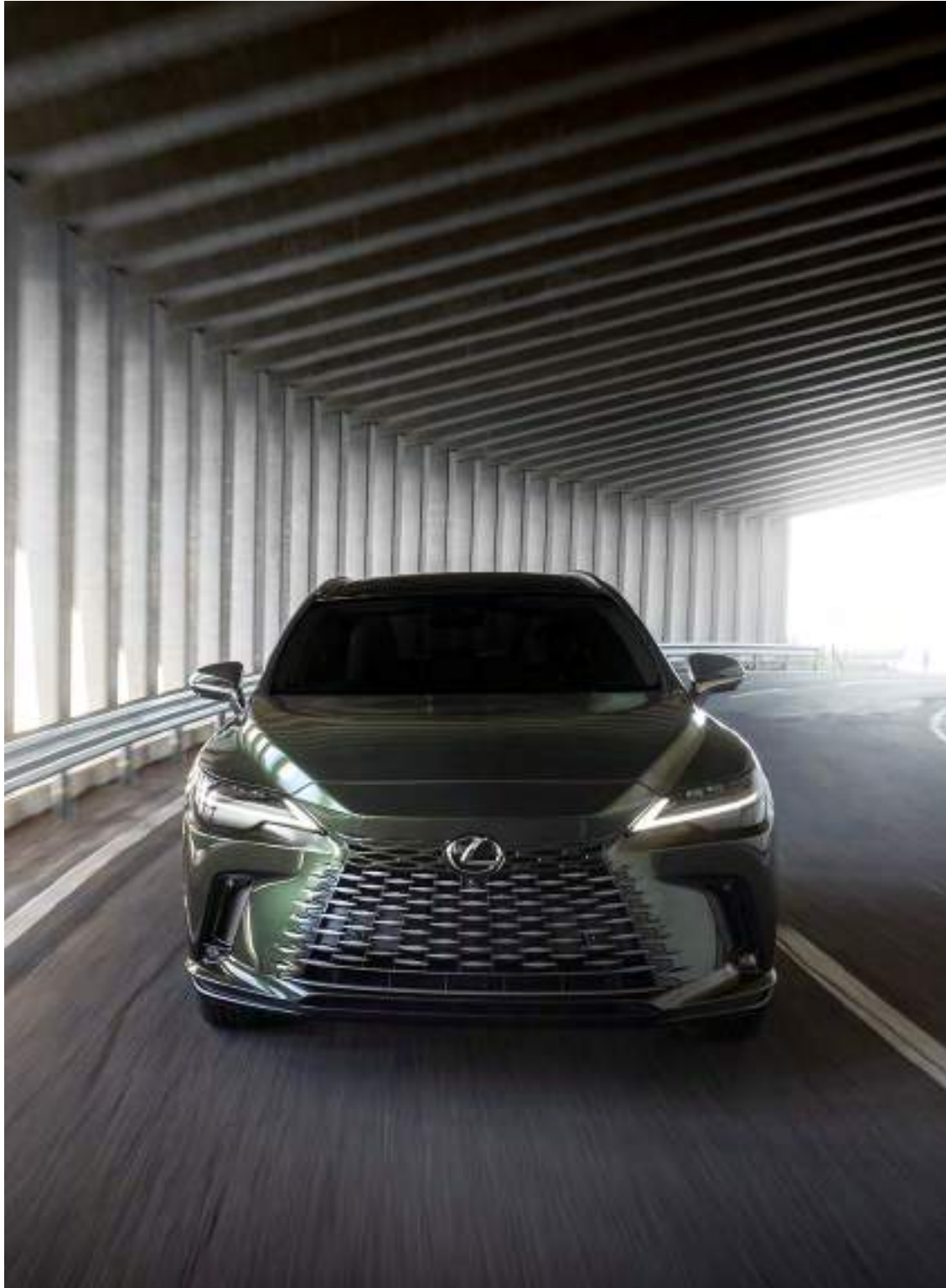
RX 450h+ AWD shown in Nori Green