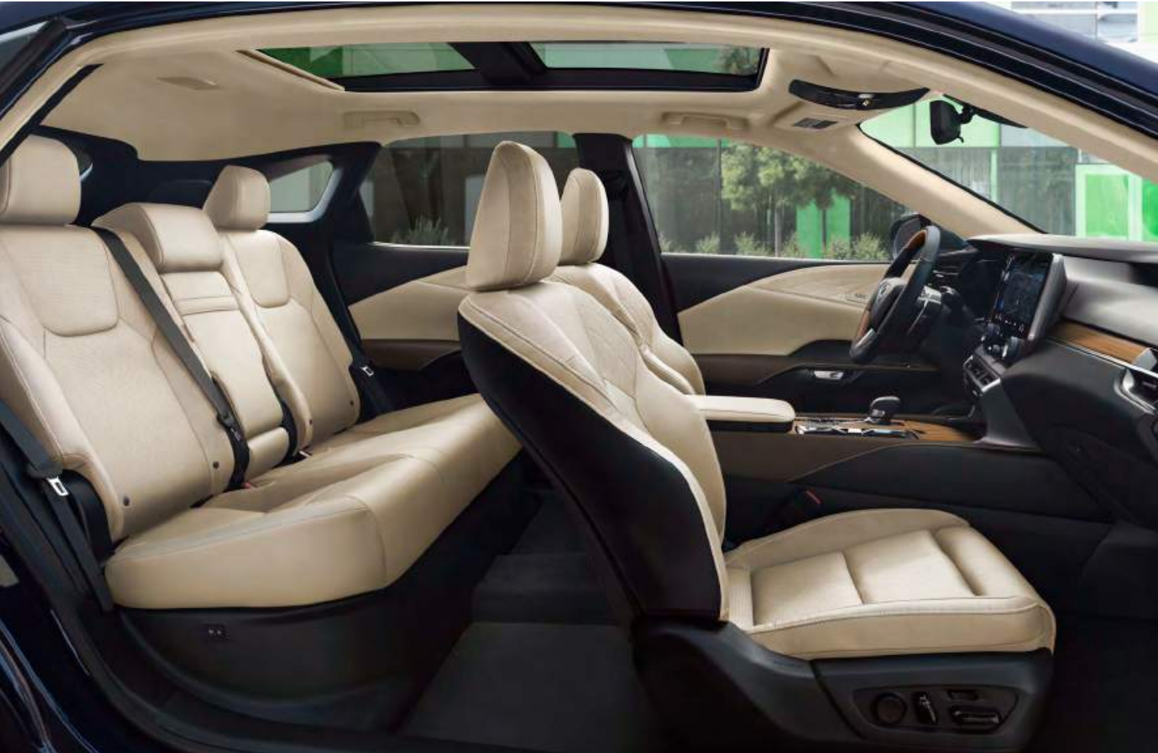
RX Luxury shown with Macadamia semi-aniline leather and Ash Bamboo interior trim