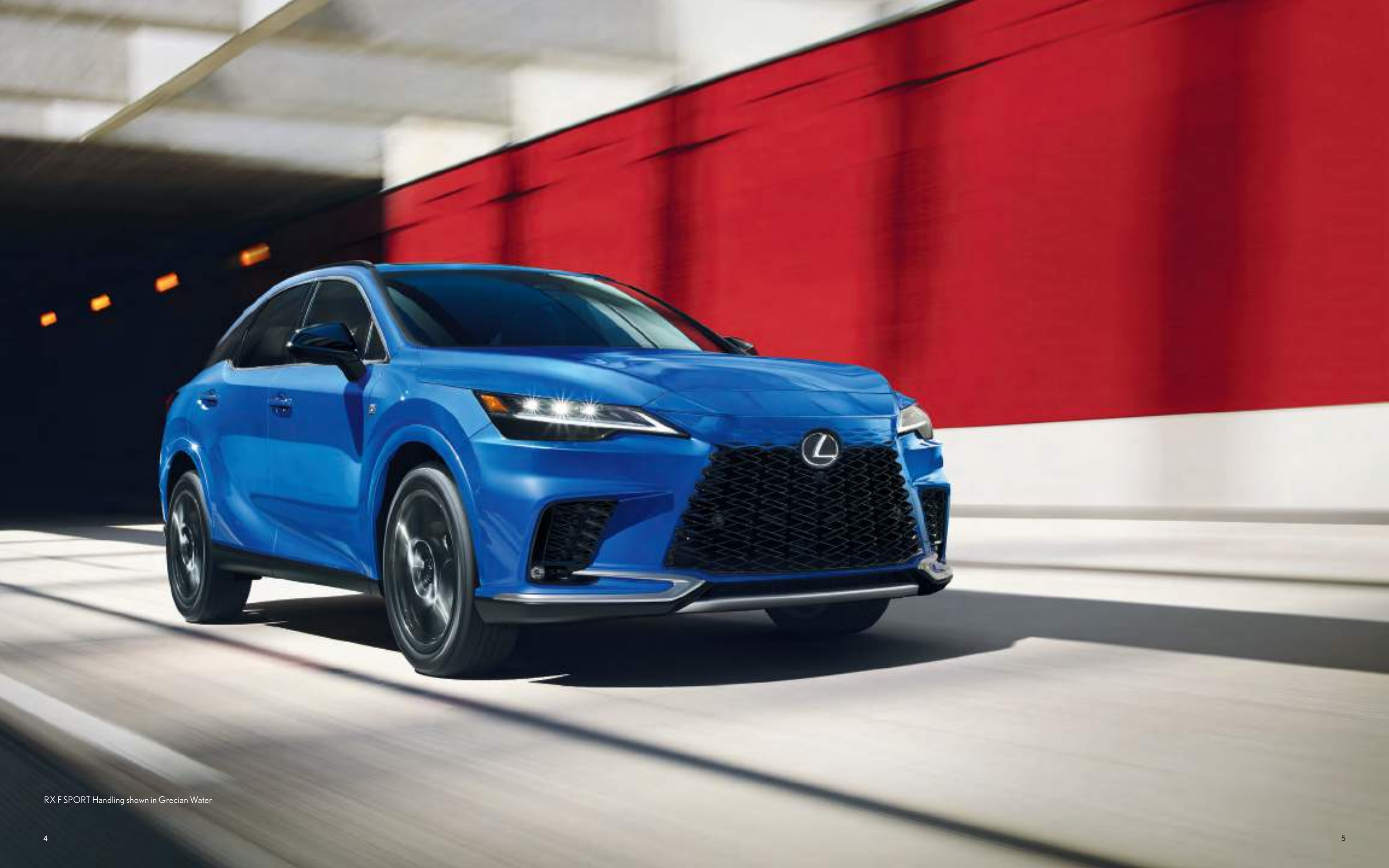
RX F SPORT Handling shown in Grecian Water