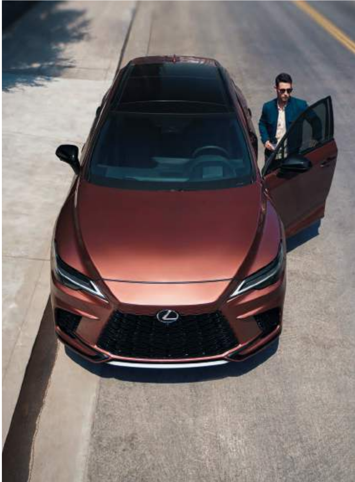
RX F SPORT Performance shown in Copper Crest ®