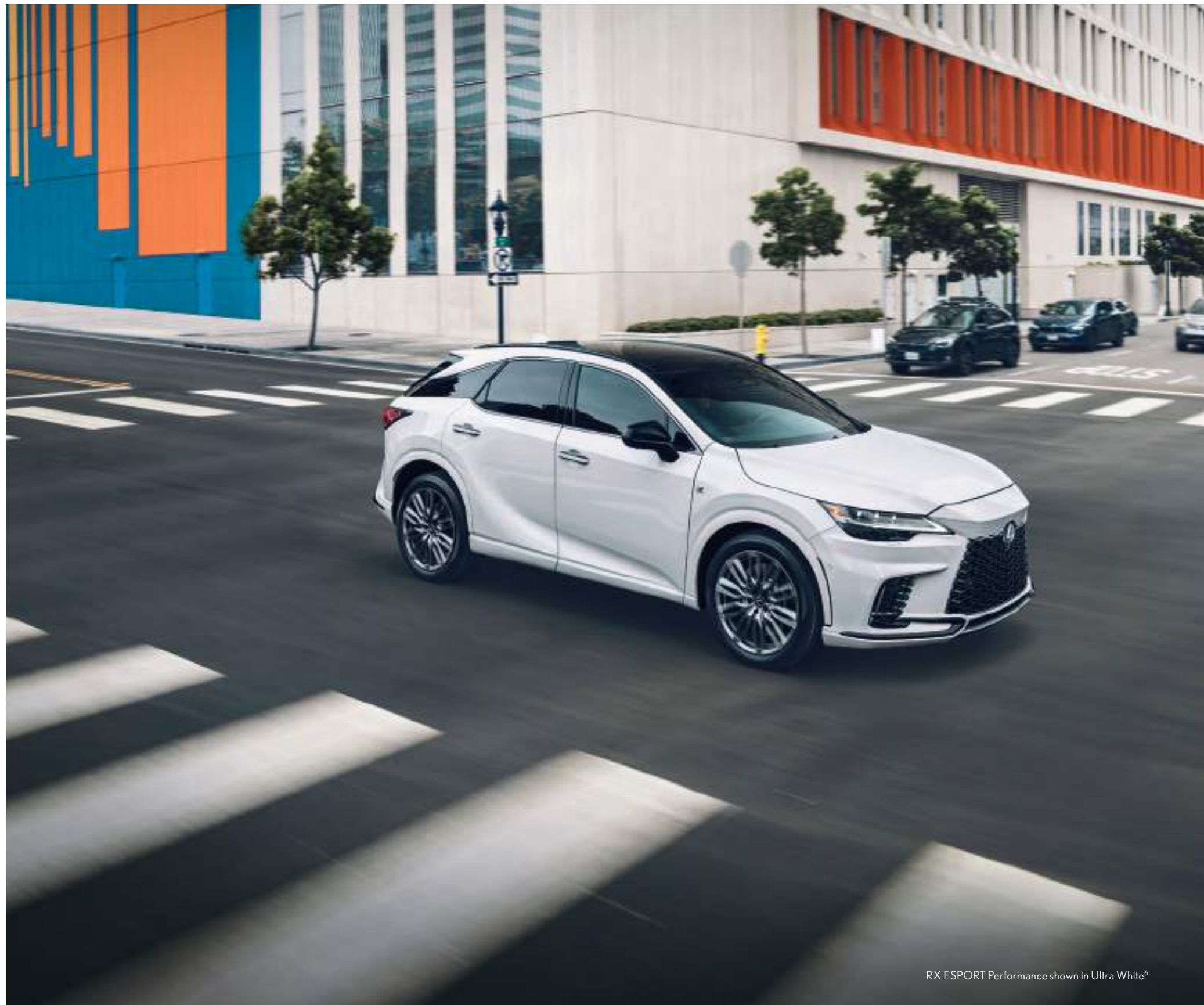
RX F SPORT Performance shown in Ultra White 6