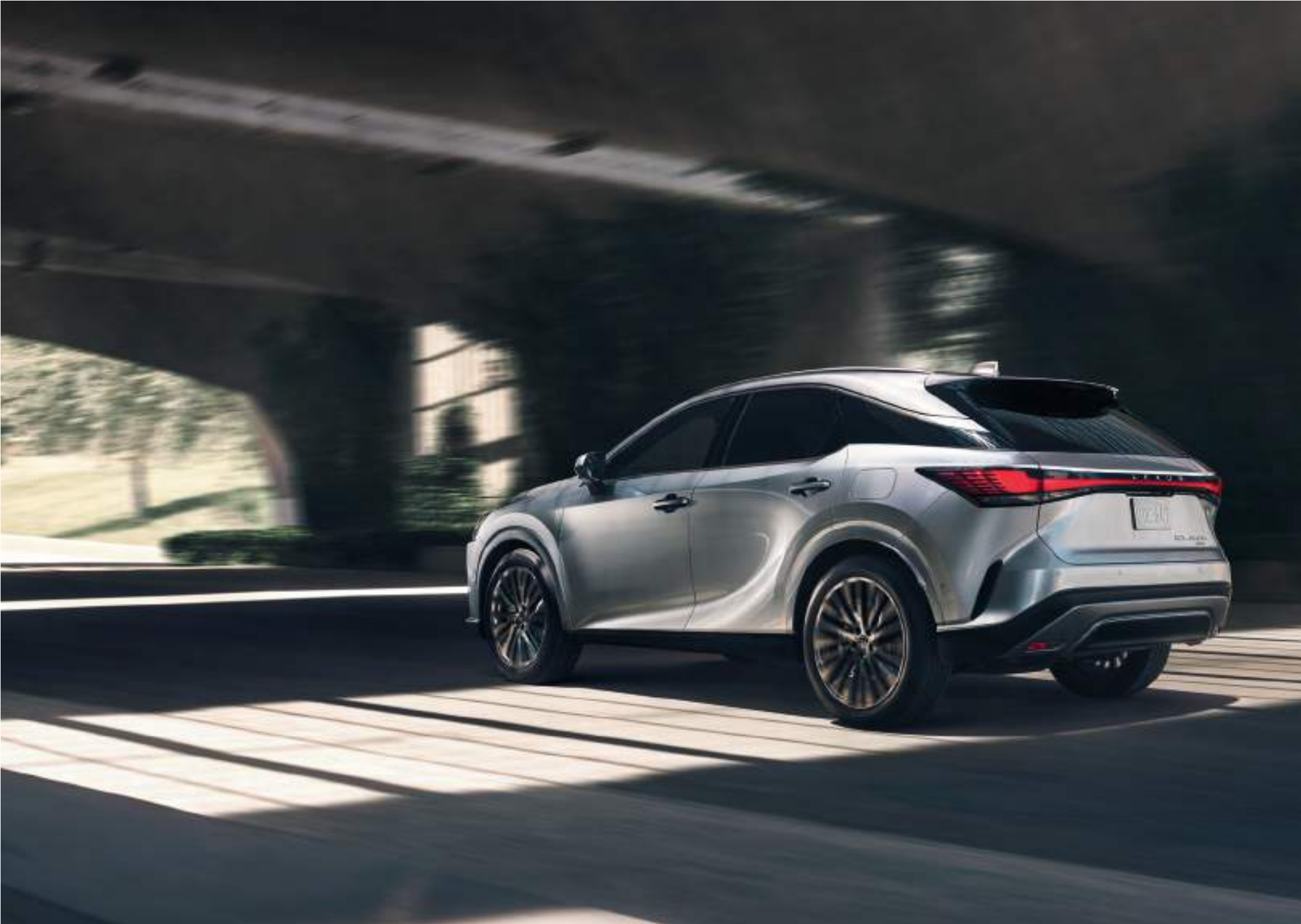
RX 450h+ Luxury AWD shown in Iridium 6

It starts with a generously equipped RX Luxury grade and adds a proven 2.5-liter in-line four-cylinder gasoline engine, a high-density lithium-ion battery pack and an advanced all-wheel drive system. With a full charge, the RX 450h+ has an EPA-estimated 37 miles of all-electric driving range 5 and an EPA-estimated 83 MPGe. 10 And when your journey takes you beyond the plug, the RX 450h+ can seamlessly continue to operate in hybrid mode and has an EPA-estimated 35-MPG combined. 10 So plug in on your schedule and see where your roads take you.