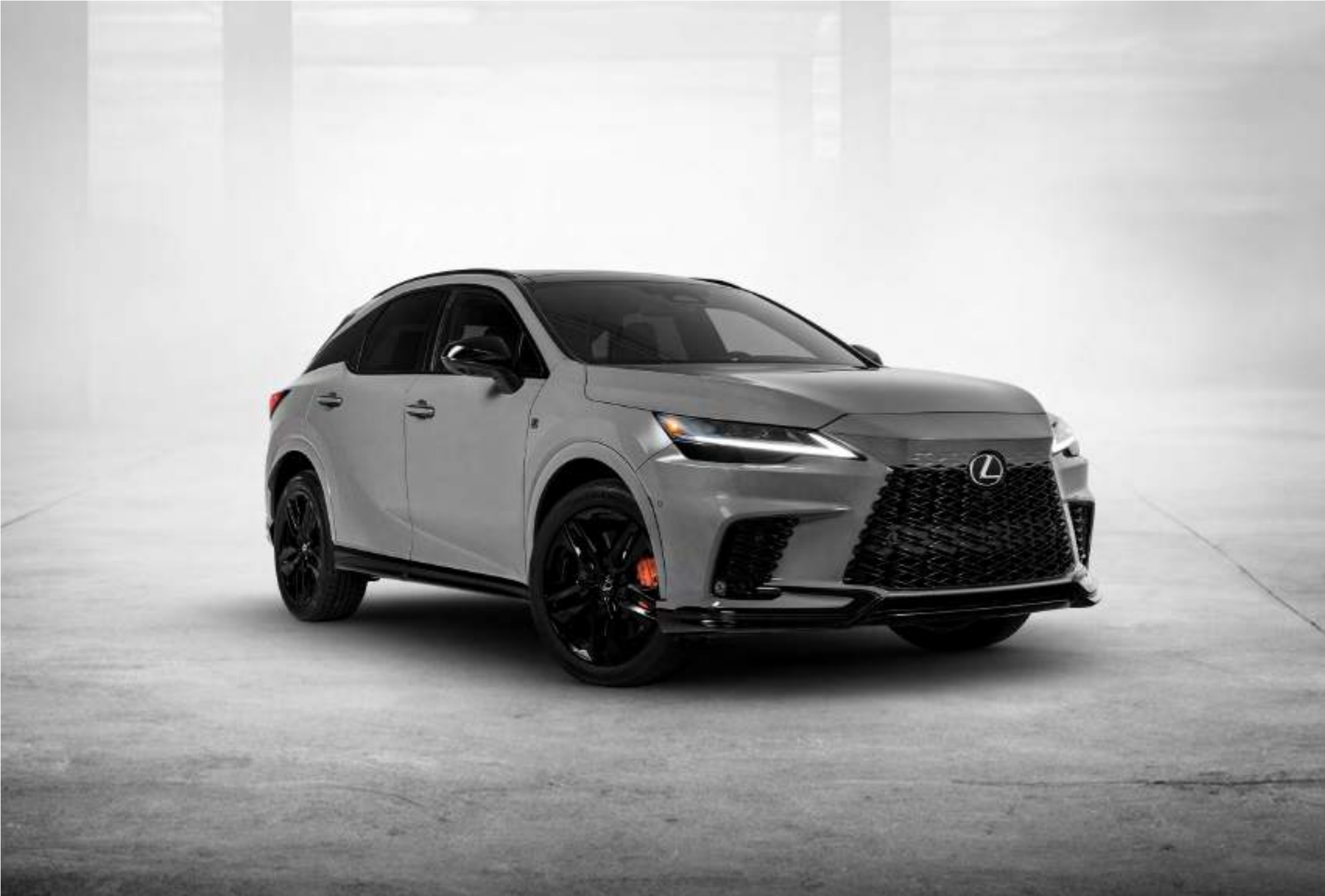
RX Black Line Special Edition shown in Incognito