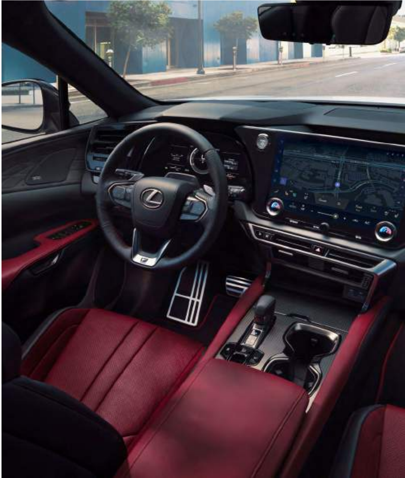
RX F SPORT Performance shown with Rioja Red leather and Dark Graphite Aluminum interior trim