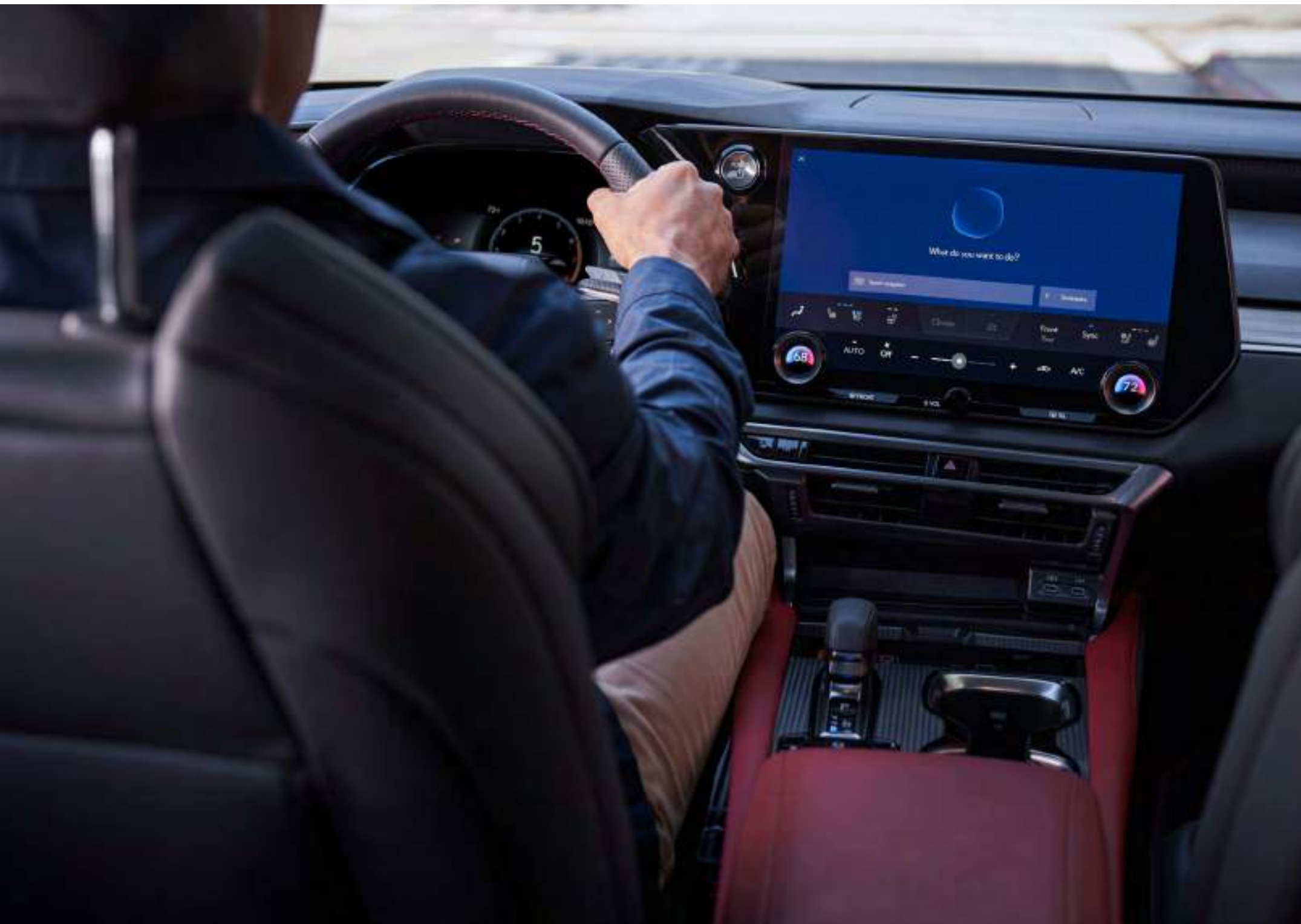
RX F SPORT Performance shown with 14-inch touchscreen display and Rioja Red leather and Dark Graphite Aluminum interior trim