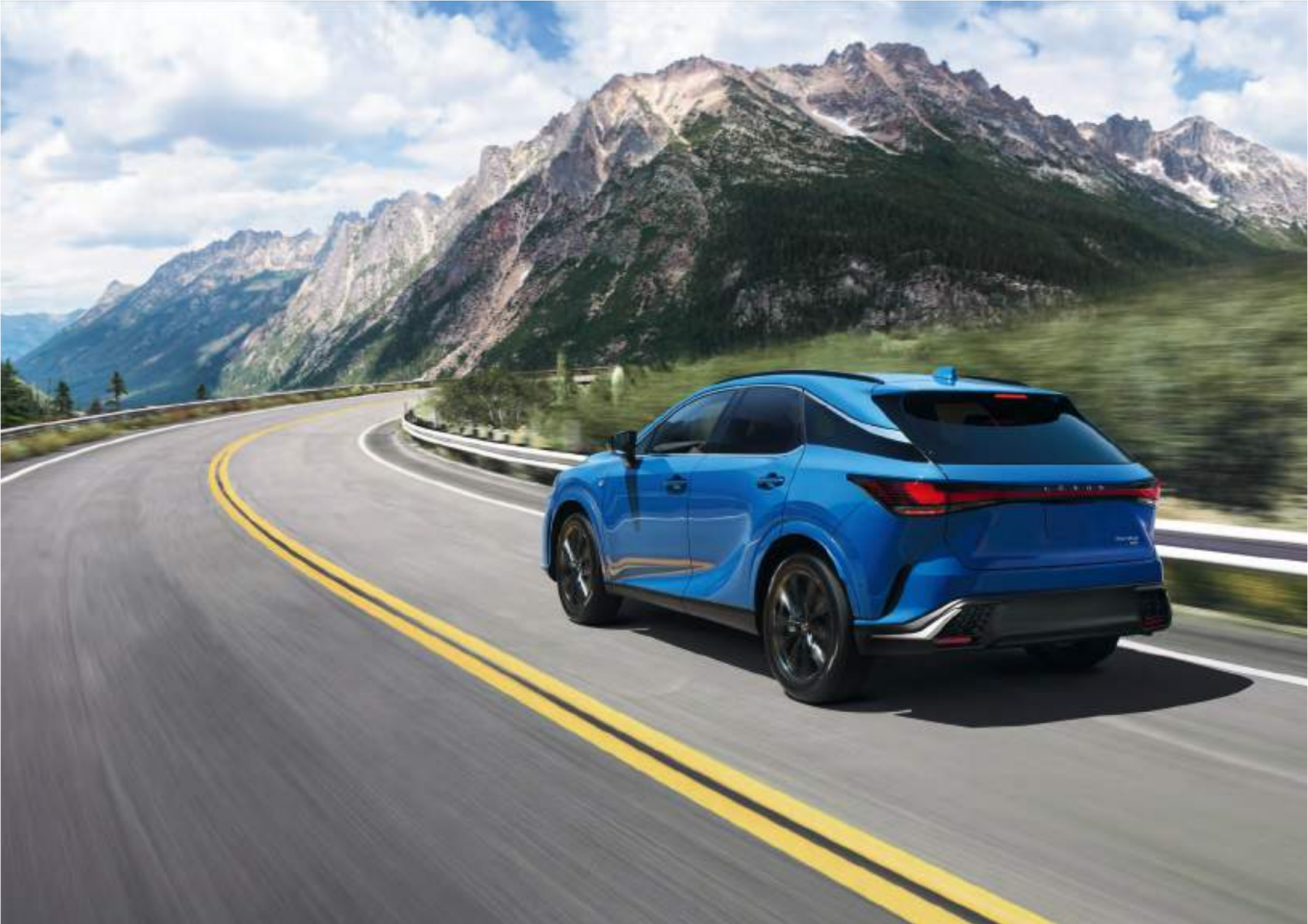
RX F SPORT Handling AWD shown in Grecian Water

In addition to more aggressive styling inside and out, the RX F SPORT Handling boasts features that deliver even more control and exhilarating intensity. It is equipped with the same available Adaptive Variable Suspension found in high-performance Lexus vehicles, allowing you to customize the shock absorber settings for improved ride comfort or reduced body lean as you enter and exit turns. Steering-wheel-mounted paddle shifters put thrilling performance right at your fingertips, offering lightning-fast upshifts and heart-racing split-second downshifts.