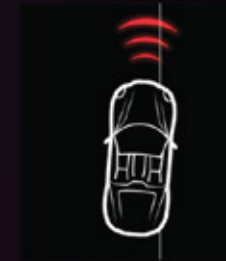
Lane Departure Warning System