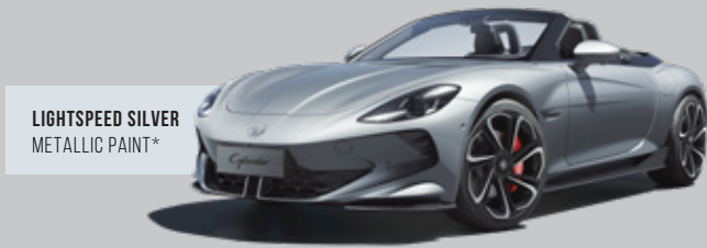
LIGHTSPEED SILVER METALLIC PAINT*