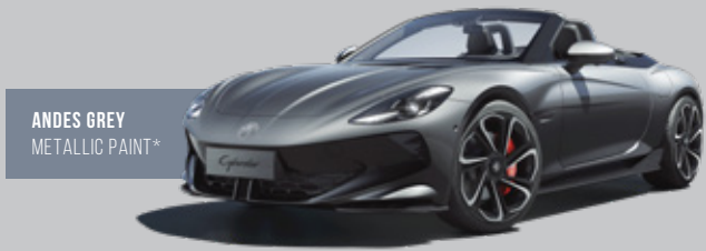
ANDES GREY METALLIC PAINT*