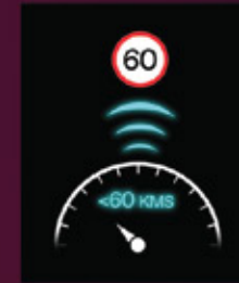
Intelligent Speed Limit Assist