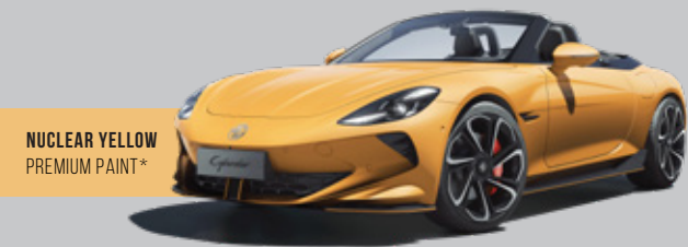
NUCLEAR YELLOW PREMIUM PAINT*