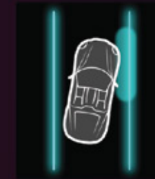
Lane Keep Assist