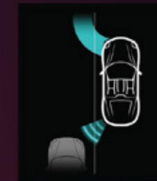
Lane Change Assist