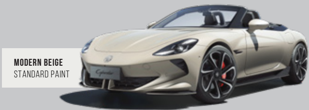
MODERN BEIGE STANDARD PAINT

MAKE YOUR MG CYBERSTER AS UNIQUE AS YOU ARE. WITH SIX STRIKING BODY COLOURS AND TWO ROOF OPTIONS, YOU CAN EXPRESS YOUR PERSONALITY IN EVERY DETAIL.