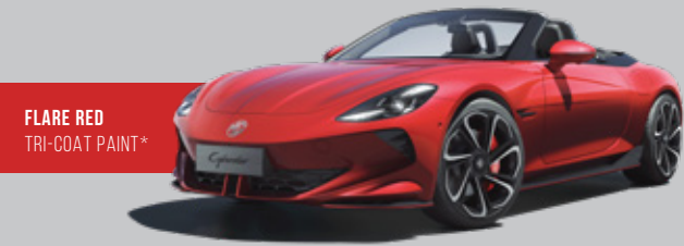
FLARE RED TRI-COAT PAINT*