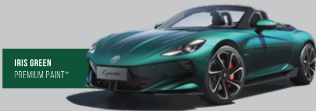
IRIS GREEN PREMIUM PAINT*