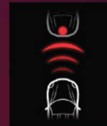
Active Emergency Braking (AEB)